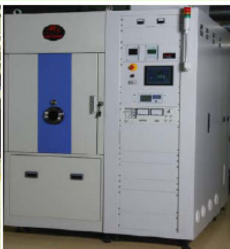
CIGS 蒸着装置 CIGS coater