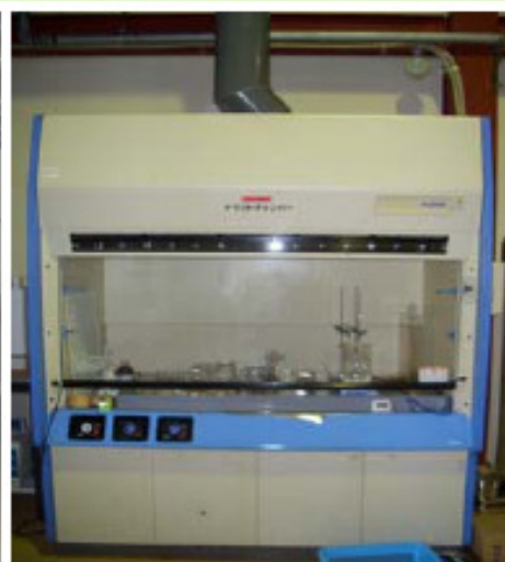
CBD 成膜装置 CBD coater