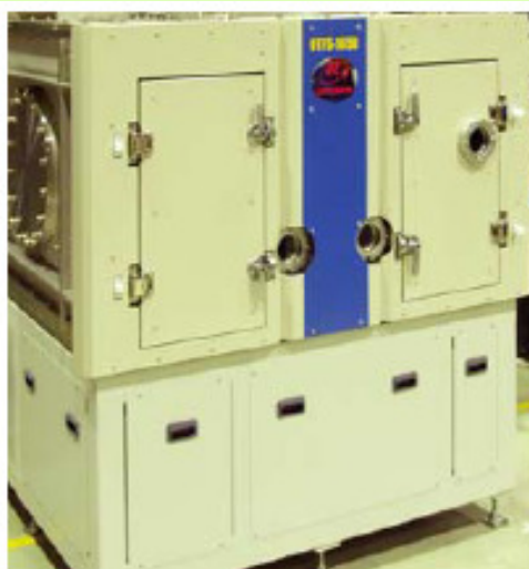
多元スパッタ装置 Sputter coater