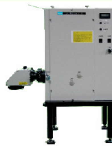
I-V 電気出力測定装置 I-V Meas. tester